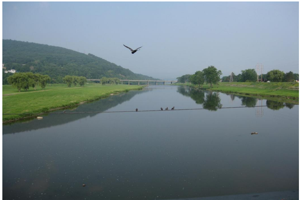
Chemung River, Corning