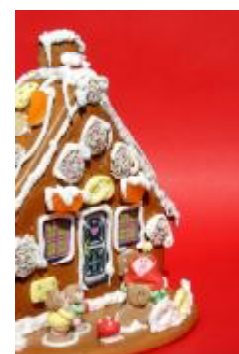
Gingerbread House Decorating at Watson Homestead, Saturday, Dec. 10