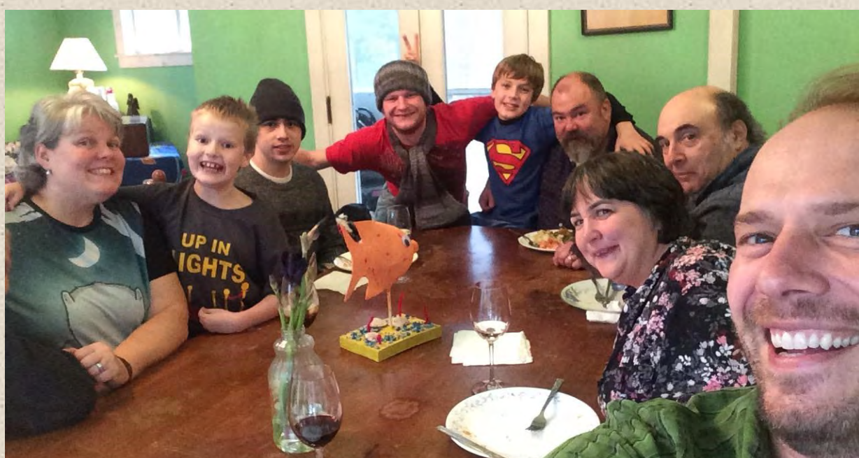
Several UUFBF members gathered together for a Thanksgiving Feast at the Telford Home. Great times had by all!